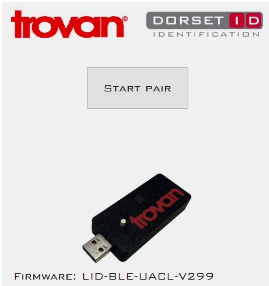
Figure 1 BLE Base is found, pairing process can be started.

Press the [Start Pair] button to start the pairing process. Pairing is done by scanning a tag with the handheld that you'd like to pair to connected dongle.